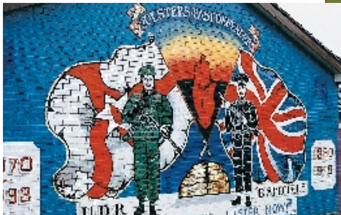
Pro-Protestant mural: backing ties with the United Kingdom

Catholic cause: mural advocating a united Ireland